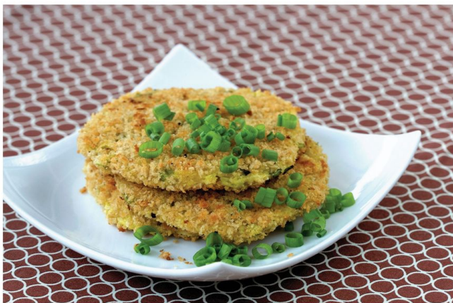
Scallion Potato Pancakes (page 61) 2nd Avenue Vegetable Korma (page 226)