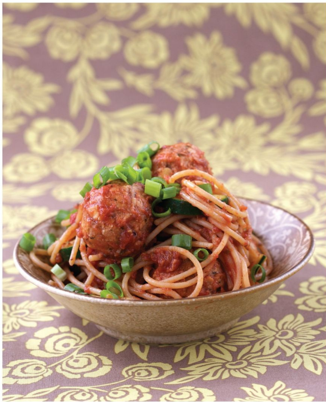
Cajun Beanballs & Spaghetti (page 190)