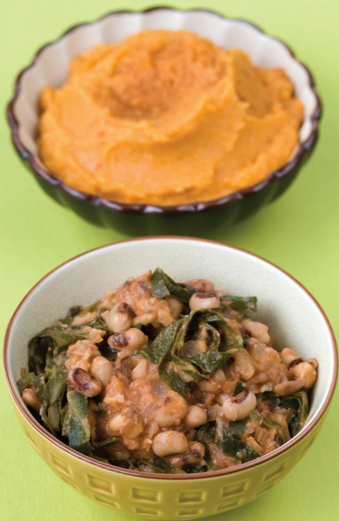
Hottie Black-Eyed Peas & Greens (page 119) and Ginger Mashed Sweet