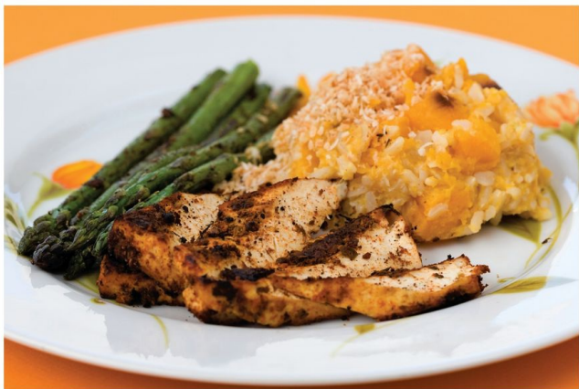
Broiled Blackened Tofu (page 147), Butternut Coconut Rice (page 80), and Jerk Asparagus (page 91) Mushroom & Cannellini Paprikas (page 127) and Scarlet Barley (page 69)