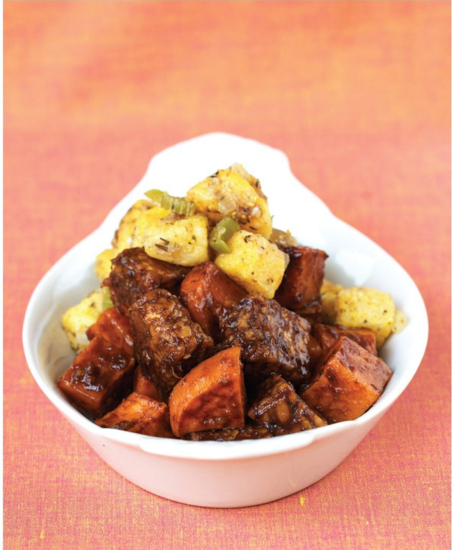
Tamarind BBQ Tempeh & Sweet Potatoes (page 159) and Polenta