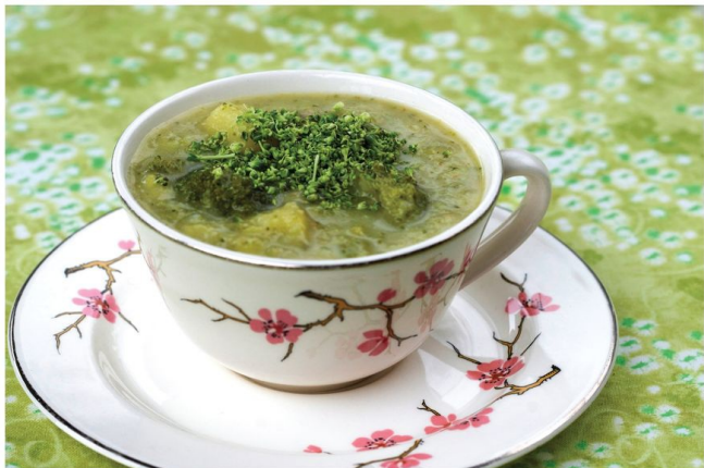
Bistro Broccoli Chowder (page 204) Spinach Linguine with Edamame Pesto (page 174)