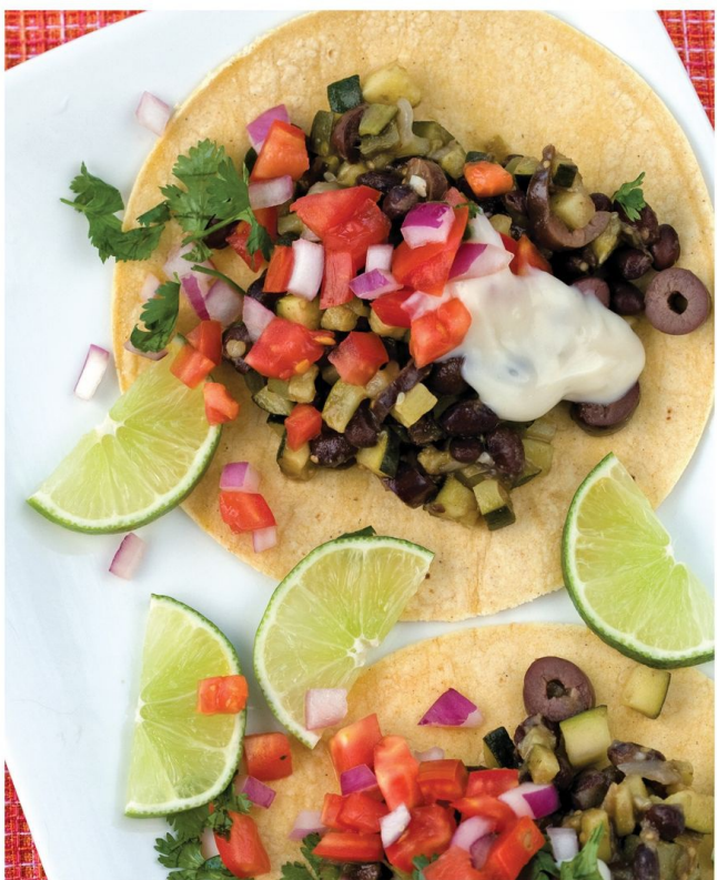
Black Bean, Zucchini, & Olive Tacos (page 131) www.ketabha.org