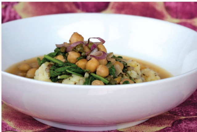
Chickpea Piccata (page 115) and Caulipots (page 54) Caribbean Curried Black-Eyed Peas with Plantains (page 129)