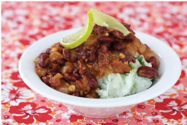
Mango BBQ Beans (page 133) and Mashed Yuca with Cilantro & Lime (page 57) Veggie Potpie Stew (page 251) and Sweet Potato Drop Biscuits (page 253)