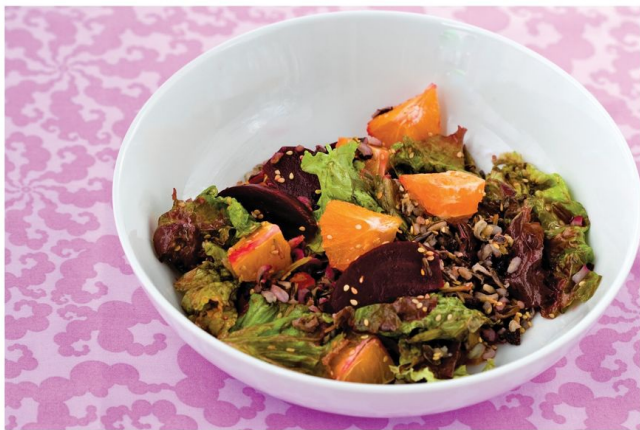
Wild Rice Salad with Oranges & Roasted Beets (page 39) Sushi Roll Edamame Salad (page 20)