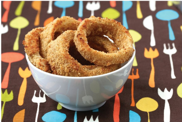
OMG Oven-Baked Onion Rings (page 59) Spinach Lasagna with Roasted Cauliflower Ricotta &. Spinach (page 179)