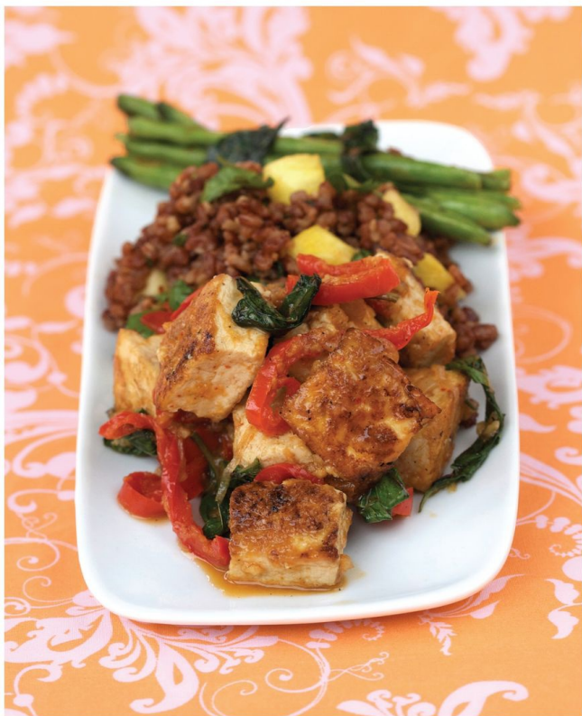
Red Thai Tofu (page 149), Bhutanese Pineapple Rice (page 72), and www.ketabha.org